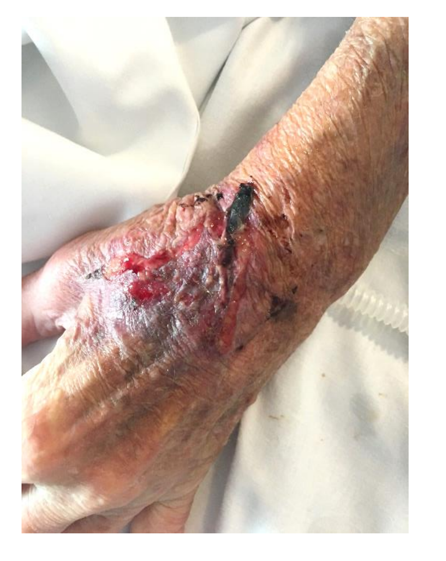
After 7 days