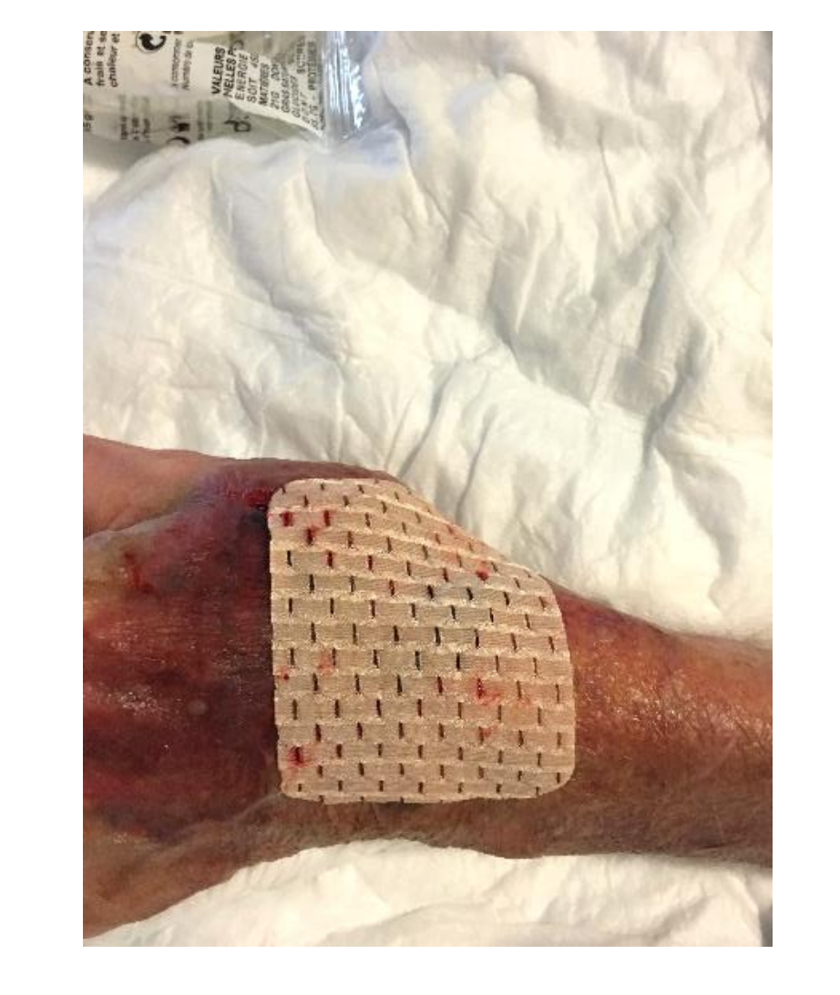
D0: Coverage by the dressing