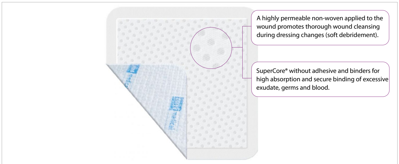
Figure 1. Construction of Curea dressing